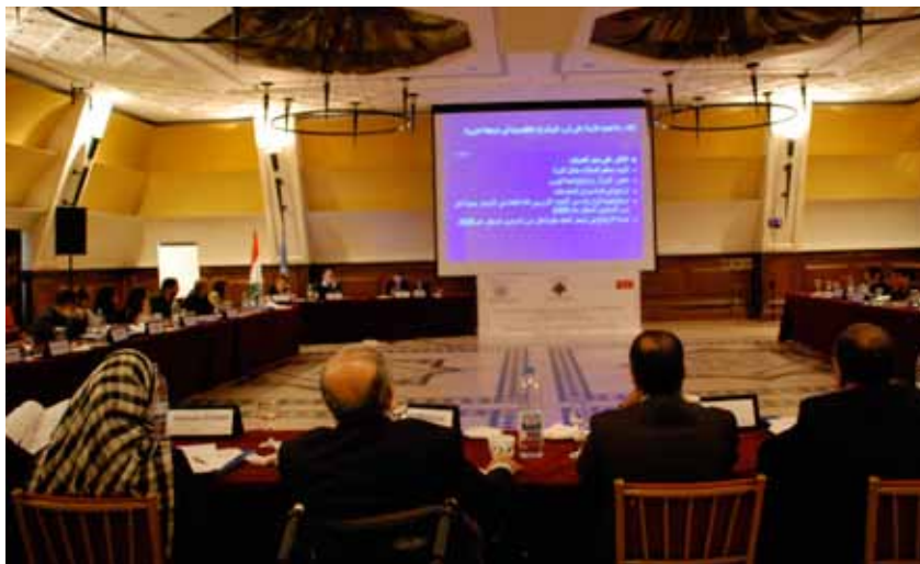
High Level Expert Group Meeting on the Preparation of the Arab Countries for the 7th WTO Ministerial Conference