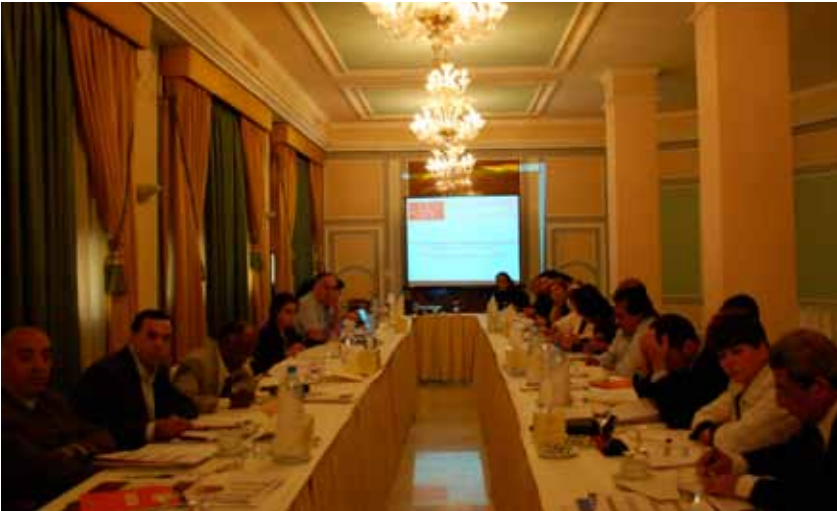
ANND General Assembly Meeting

Addressing social and economic rights in the Arab region: issues of democracy, development, and economic and trade policies