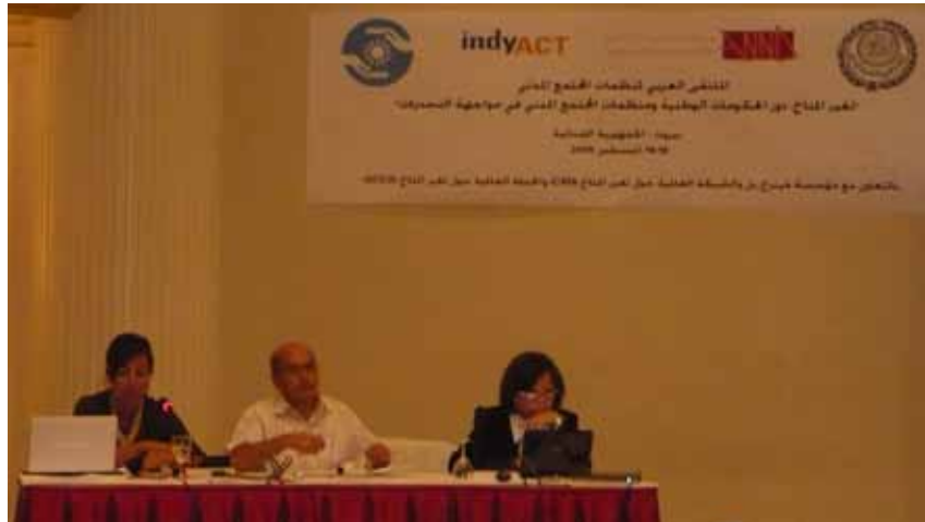
Regional Conference on “Climate Change Crisis and the role of national governments and civil Society in facing the challenges”