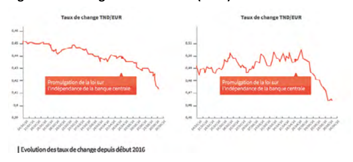
Figure 4: Exchange rate evolution (euro) since in 2016

Author: Tunisian Observatory for Economy